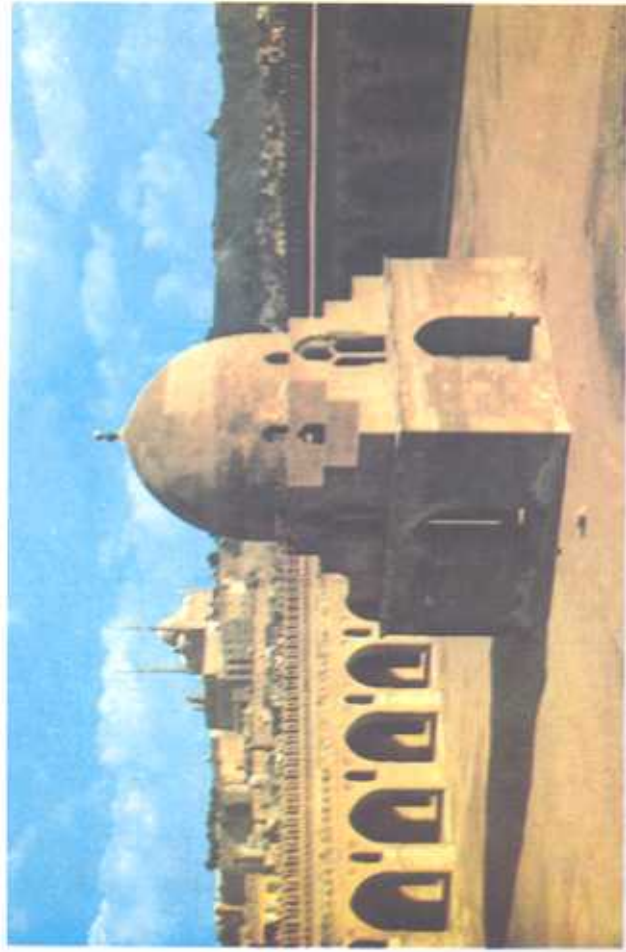
Cairo - Panoramic view of the Citadel from Ibn el Touloun Mosque